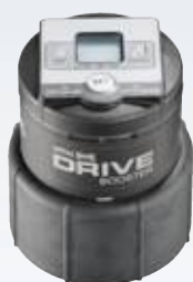
LCD screen with adjustment (1 to 12 months) + discharge function